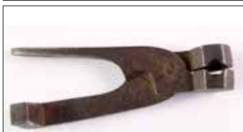
Lot # 2418 .40 Caliber Single Cavity Ball Mold 1840-1870 . Small single cavity .40 caliber single ball mold. Est. $50 ~ $100 HWAC# 40716