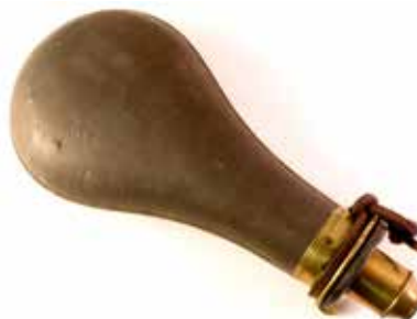
Powder Flask 1850-1865 Civil War era powder flask "G & J.W. Hawksley" bronze powder flask with working powder dispenser for rifle or pistol c. 1850-1865 Silver rim around entire flask. Est. $150 ~ $350 HWAC# 39818