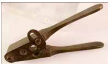
Lot # 2420 Rare Civilian Brass .44 Colt Double Bullet Mold 1850-1870 . Rare brass civilian double cavity .44 caliber bullet mold for conical and ball. Brass bullet mold with steel sprue cutter, typical of civilian market and generally used for Colt's .44 caliber Dragoon and Army