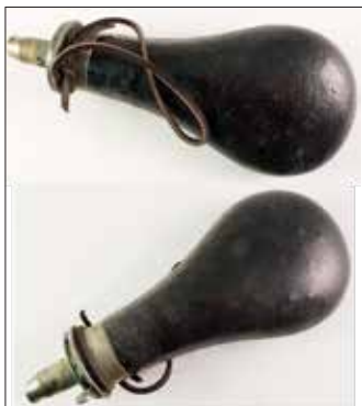
Lot # 2422 Antique Pistol Powder Flask Small antique brown leather pistol flask. Embossed