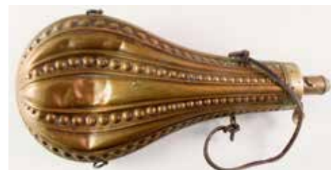
Lot # 2426 Large Colt Dragoon Style Powder Flask 1830-1860 Large ornate Colt Dragoon style brass powder flask for large pistol, rifle, or shotgun. Lower lanyard rings and upper lanyard rings. Powder release spout not working. One side very good condition, small dings. Opposite side has been pushed in somewhat. Beautiful large display flask 1830's - 1860's vintage. Est. $200 ~ $450 HWAC# 39819