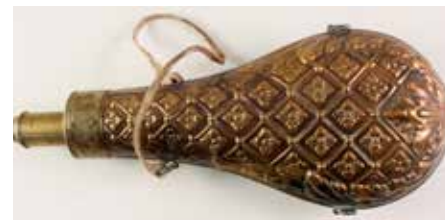
Lot # 2428 Ornate Mid-Size Powder Flask 1830-1870 Very ornate mid-size pistol/ rifle brass flask. Lanyards both upper and lower. Powder release lever missing. Mid 1830's to mid 1860's. Est. $150 ~ $350 HWAC# 39817

condition. Percussion rifle or shotgun. Flask marked 5 lbs for powder maximum. Est. $100 ~ $300 HWAC# 39815