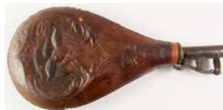
Lot # 2427 Large Embossed Leather Powder Flask Large antique brown leather rifle/ shotgun flask. Embossed leather with game scene both sides, brass powder loader with working release. Very good working

condition. Percussion rifle or shotgun. Flask marked 5 lbs for powder maximum. Est. $100 ~ $300 HWAC# 39815