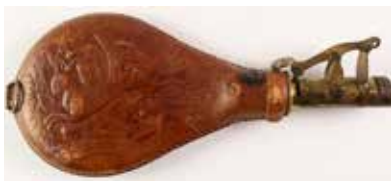
leather with game scene both sides, brass powder loader with working release. Lanyard ring on bottom of flask. Very good condition, working. Est. $75 ~ $150 HWAC# 39816