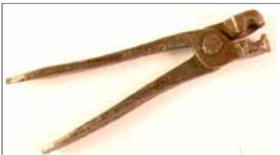
Lot # 2419 .40 Caliber Steel Scissors Bullet Mold c. 1776 c1776 .40 Caliber steel scissor mold. Single cavity ball mold. Very crude and looks to be from the Revolutionary War. More research would be required on this particular mold, but very old. Est. $150 ~ $250 HWAC# 40711