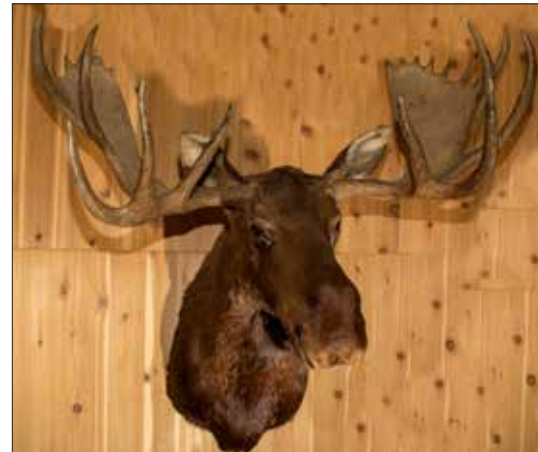
Lot # 2503 Alaskan Moose Shoulder Mount (68" Trophy Class) Huge moose shoulder mount from Alaska. Trophy Class, 68", extra heavy antlers brow tines. Stunning piece! This may place it in the top ten record sizes. This animal was shot

prior to 1988 and previously on display in a Western museum. Est. $4,000 ~ $8,000 HWAC# 43729