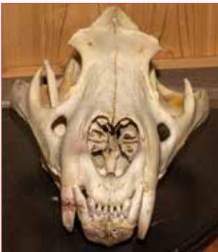
Lot # 2500 African Lion Skull A skull of an African Lion. Broken jaw. Killed prior to 1988, on display in a western museum since that time. Subject to the Endangered Species Act. May only be sold within Nevada to bonafide Nevada residents. Est. $400 ~ $800 HWAC# 43768