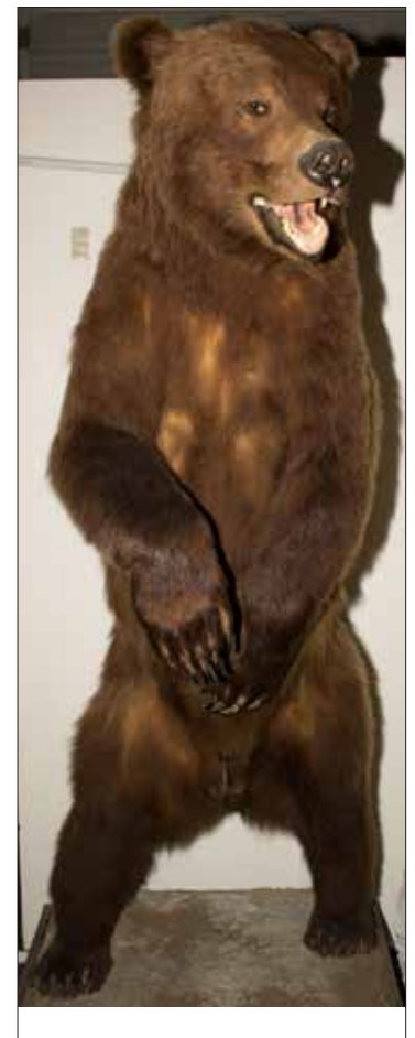
Lot # 2504 Alaskan Polar Bear Full Body Mount Spectacular Alaskan polar bear full body mount. 10 foot, standing on hind legs, open mouth, arms out. "Ice" base. Killed prior to 1988, on display in a western museum since that time. This animal falls under the terms and conditions of the Marine Mammal Protection Act. It can only be sold in Nevada to a bonafide Nevada resident. Due to the size and weight of this item, local pick-up only. Est. $15,000 ~ $30,000 HWAC# 43721

prior to 1988 and previously on display in a Western museum. Est. $4,000 ~ $8,000 HWAC# 43729