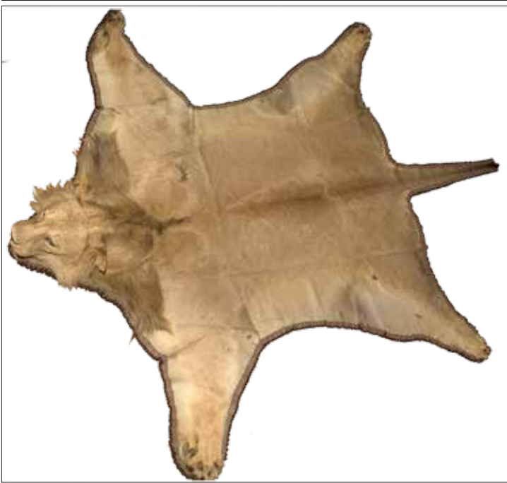
Lot # 2499 African Lion Rug A large rug of an African Lion. Light brown on dark brown felt. Impressive! Killed prior to 1988, on display in a western museum since that time. Subject to the Endangered Species Act. This may only be sold within Nevada to bonafide Nevada residents. Est. $2,000 ~ $4,000 HWAC# 43760