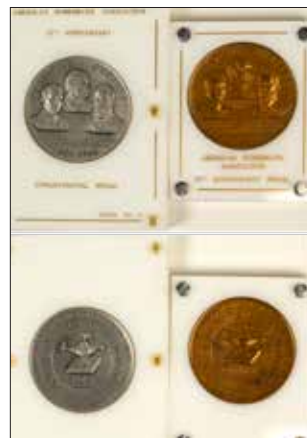
Lot # 3433 ANA 75th Anniversary Congressional Medal to US Mint Director Adams Serial number six presented to US Mint director Eva Adams. This medal commemorates the ANA's Diamond Jubilee. About 3 inches in diameter, perhaps 9 ounces of silver. Model number six also comes with a bronze copy of the same. Both are in capital plastic holders as originally sold. Only 30 of the silver medals were struck. (Don Young Collection) Est. $300 ~ $500 HWAC# 43175