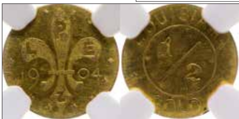
Lot # 3287 Louisiana Purchase Exposition Gold Token 1904 MO-H-61-330 "1/2". MS 64. Est. $400 ~ $600 HWAC# 41871