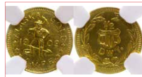
Lot # 3295 Alaska-Yukon-Pacific Expo Hart's Coins of the West 1909 Alaska AYPE gold 1/2dwt MS 64. Est. $400 ~ $800 HWAC# 41872