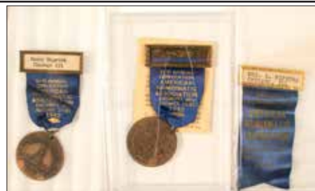
Lot # 3394 ANA 1942 & 1944 Convention Badges Two badges from the 1942 ANA convention in Cincinnati and one badge from the 1944 ANA convention in Chicago. (Don Young Collection) Est. $100 ~ $150 HWAC# 43544