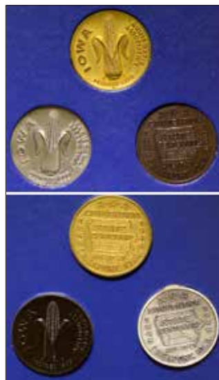
Lot # 3395 ANA 1946 Davenport, Iowa Convention Medals 1946 three medal set from the convention held in Davenport Iowa. This set includes the 10k gold piece, .45 troy ounces, plus the silver and bronze pieces in original box. (Don Young Collection) Est. $350 ~ $600 HWAC# 43545