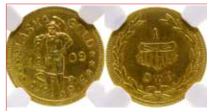
Lot # 3293 Alaska-Yukon-Pacific Expo Hart's Coins of the West 1909 NGC MS 62. 1dwt. Est. $300 ~ $600 HWAC# 41867