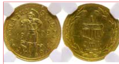
Lot # 3294 Alaska-Yukon-Pacific Expo Hart's Coins of the West 1909 NGC MS 62. 1dwt. Est. $300 ~ $600 HWAC# 41868