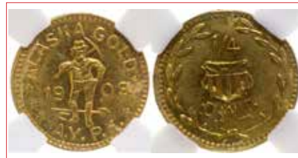
Lot # 3290 Alaska-Yukon-Pacific Expo Hart's Coins of the West 1909 NGC MS64, 1/4 dwt. Est. $400 ~ $800 HWAC# 41859