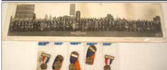
Lot # 3390 ANA 1938 & 1939 Convention Badges & Photograph The 1938 group includes two badges

for the Columbus convention, and the 1939 contains three badges from the New York convention. One of the 1938 badges has the name of J Henri Ripstra, ANA president at the time. The photograph is a large panorama, approximately 3 1/2 feet long of the attendees of the 1939 convention in New York. (Don Young Collection) Est. $200 ~ $400 HWAC# 43543