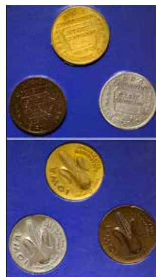
Lot # 3396 ANA 1946 Davenport, Iowa Convention Medals Second set of medals in original box from the 1946 Iowa Convention including the 10k gold piece (.45 troy). (Don Young Collection) Est. $350 ~ $600 HWAC# 43546