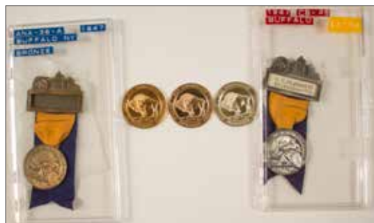
Lot # 3397 ANA 1947 Buffalo Convention Badges & Medal A group of material from the 1947 Buffalo ANA convention. One silver badge, one

bronze badge, one medal set in the official case including the gold medal, .62 Troy ounces, assumed to be 10K. (Don Young Collection) Est. $500 ~ $750 HWAC# 43547