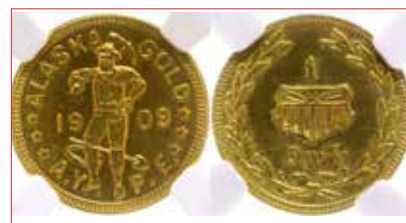
Lot # 3292 Alaska-Yukon-Pacific Expo Hart's Coins of the West 1909 NGC MS 63. 1dwt. Est. $300 ~ $600 HWAC# 41863