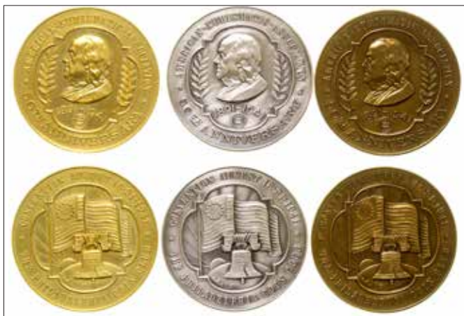
Lot # 3393 ANA 1941 Convention Medal Set 1941 convention medal set in silver, bronze, and coin gold. Rare. $1200 melt value. (Don Young Collection) Est. $1,300 ~ $2,000 HWAC# 43542