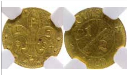
Lot # 3282 Louisiana Purchase Exposition Gold Token 1904 NGC MS 63. MO H-61-330 "1/2". Est. $300 ~ $400 HWAC# 41860