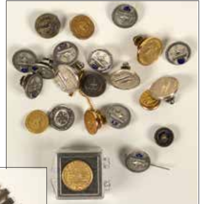
Lot # 3430 ANA: Don Young's Personal Lapel Pin Collection About 20 different lapel pins including 40 and 50 year award pins given to Young over time. Please inspect. (Don Young Collection) Est. $200 ~ $400 HWAC# 43359