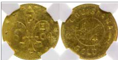
Lot # 3285 Louisiana Purchase Exposition Gold Token 1904 NGC MS 63. MO H-61-320 "1/4". 14 stars. Est. $300 ~ $400 HWAC# 41865