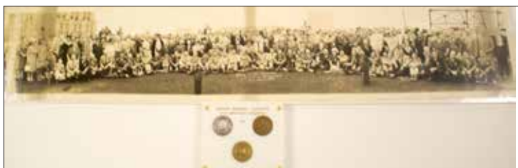
Lot # 3392 ANA 1941 50th Anniversary Convention Medals & Photograph This lot contains the three medal set (silver, gilt, and bronze) in original holder. Also contains a large panorama photo of the attendees. (Don Young Collection) Est. $200 ~ $300 HWAC# 43541