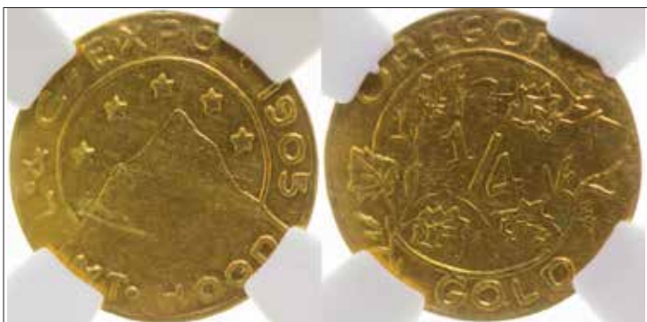
Lot # 3288 Lewis & Clark Exposition Gold Token 1905 NGC MS 62. Oregon Gold "1/4" Est. $400 ~ $1,000 HWAC# 41869